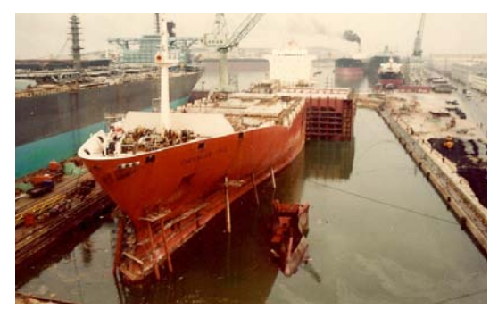
A new section being fabricated as the drydock was widened. The new section

being slid into place and new bow section being fitted.