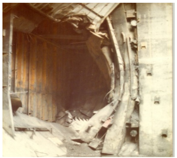
The same damage viewed from different sides of the bulkhead.