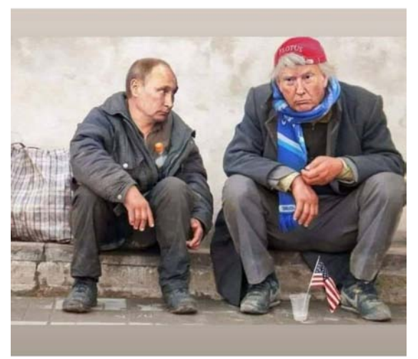
"... it's disappointing that he will not be joining us ... it's over excitement with an RT deal ... Covid cure and soda consumption ... you forgot to switch that fantastic camera's microphone on Comrade ... it would have been a great ... even greater ...the greatest story ever!!!"