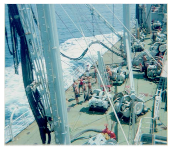
1968 RFA Tidesurge at work

hen on Beira, one of the main stops was always Mombasa. In those days, it was a lovely run ashore, up to the mission for a swim, and a walk along Kilindini road to the Tusks and beyond. The gentle bartering with the owners of the 'K Boats' to get a lift back to the ship.